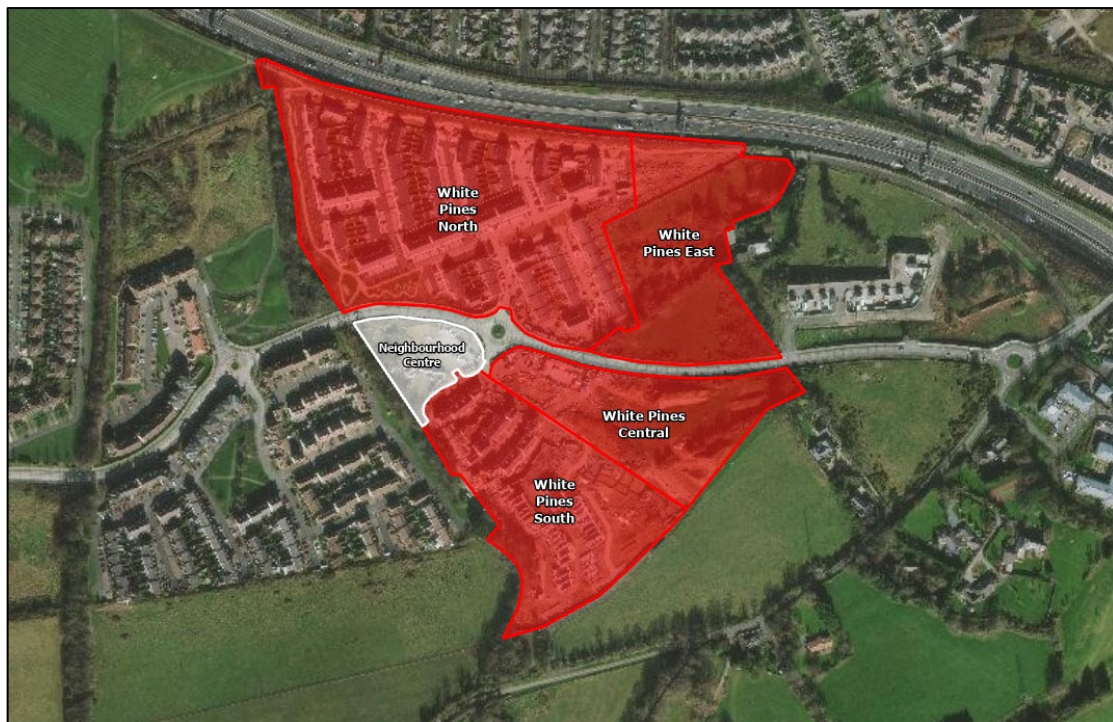
Figure 1.1: Indicative Site Location Plan, prepared by TPA, 2021.

Ardstone Homes 1 have requested that a childcare capacity audit be undertaken for the assessment of 4 No. distinct residential developments known as ‘White Pines North, South, East and Central’ all located at Stocking Avenue, Ballycullen, Dublin 16. The combined development is expected to comprise a maximum of 659 No. units, including 151 No. 1-bedroom units, 198 No. 2-bedroom units, 151 No. 3-bedroom units, 132 No. 4-bedroom units and 27 No. 5-bedroom units along with all associated car parking, landscaping and service works once completed, as indicated in Table 1.1.